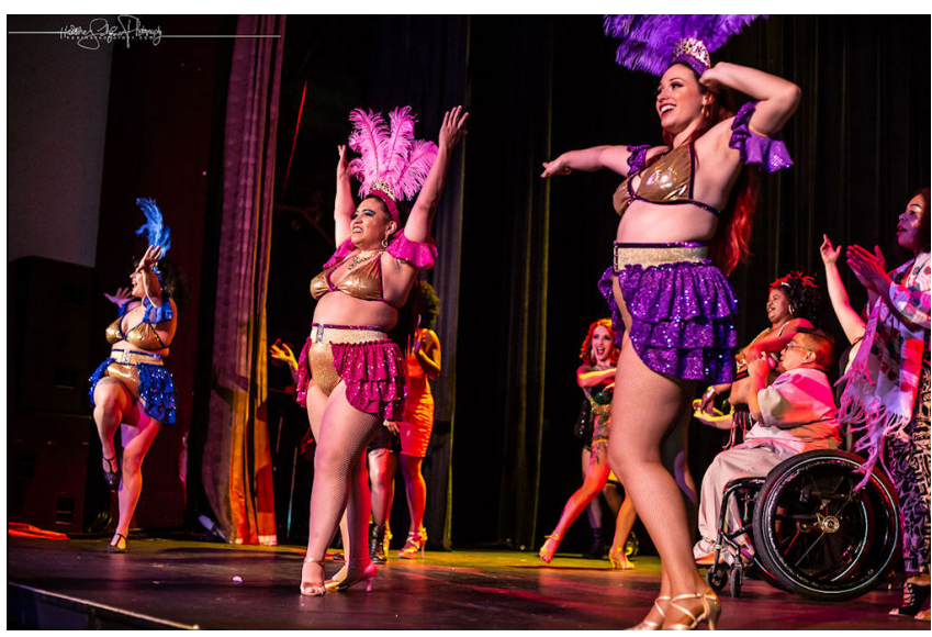
Azucar, September 2018 Finale

Azucar: A Latine Cabaret Experience is set to make its return to Olympia with a fresh format and in a new venue. Azucar will feature music and performances from a revolving all-Latine lineup and will be hosted by Azucar producer Latina K Turner D'Ho as well as VenDetta Petty Kash D'Ho.