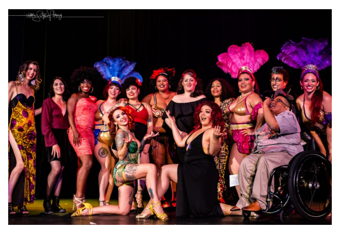
Azucar, September 2018

Latina decided 2023 was the right time to rekindle the show as Azucar: A Latine Cabaret Experience, with performances scheduled for roughly every other month at the Cryptatropa Bar (The Crypt) in Olympia, with a break during the summer months. Azucar's relaunch will begin on September 16, coinciding with the beginning of National Hispanic Heritage Month.