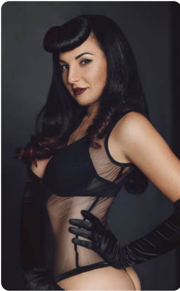
Name: Freckles Galore Location: Fort Myers, FL Heritage: Puerto Rican