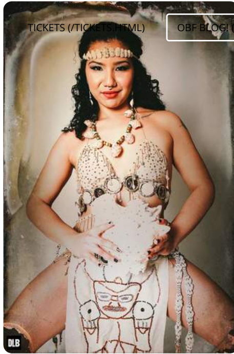
Name: Bugalú Boogie Location: Philadelphia, PA Heritage: Dominican/Cuban